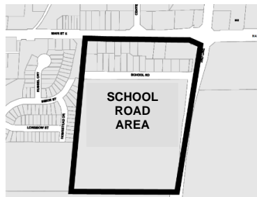
BY-LAW 20-2020 - SCHEDULE C