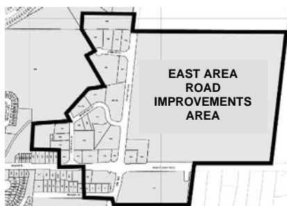
BY-LAW 21-2020 - SCHEDULE C